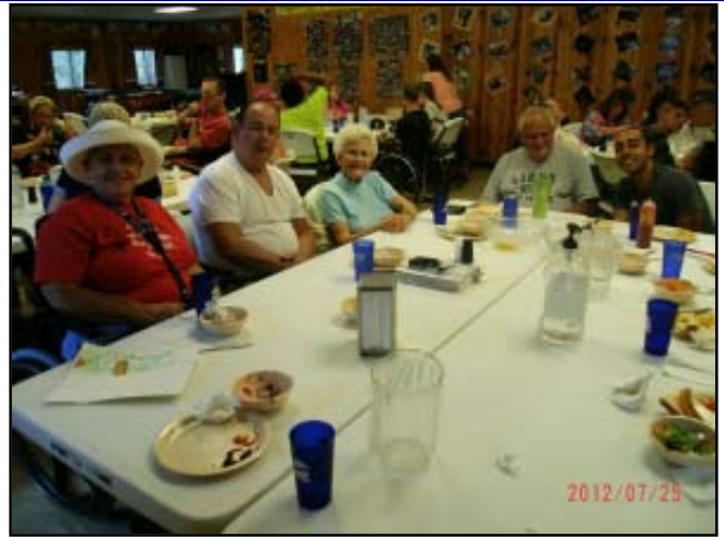
Delicious food and fellowship at meal time.