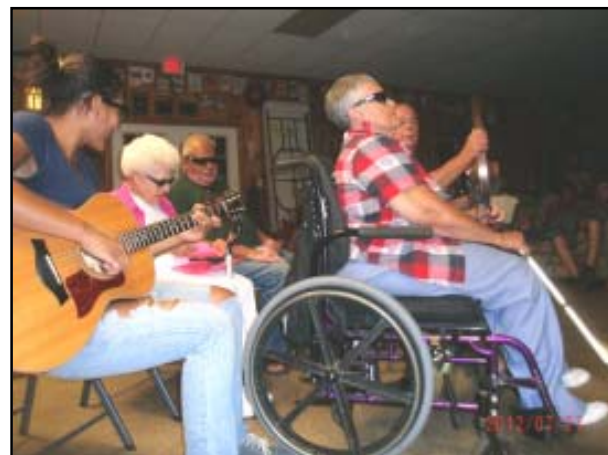
3 blind mice sung by TSB members at talent show.