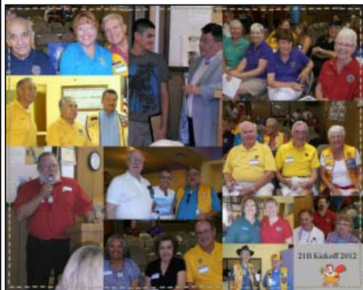
Look at those smiles at the 21B Kickoff in Mammoth August 11!