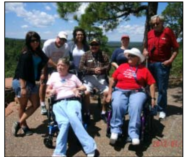
Wonderful hike to the scenic Mogollon Rim.