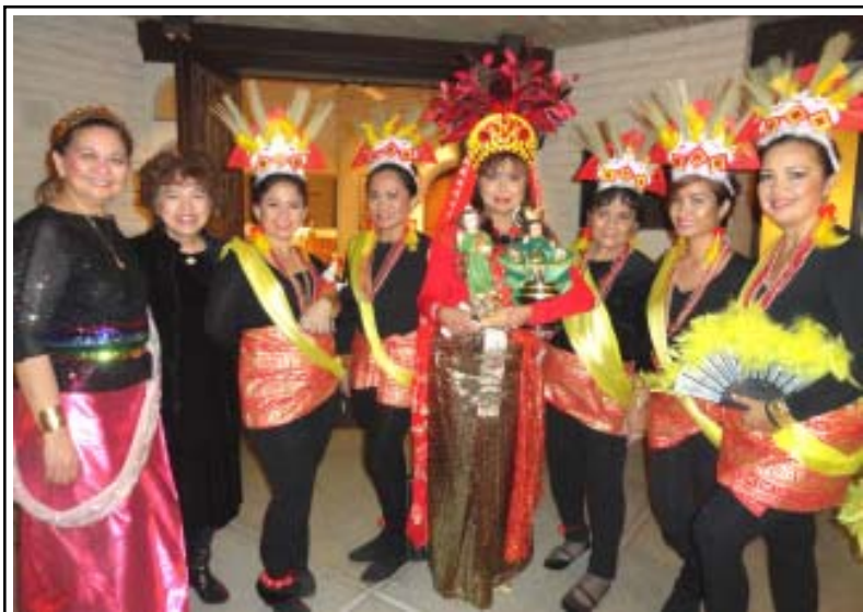
Phoenix Barangay, Phoenix Phil-Am and friends – Philippine celebration of “Sinulog” – Jan 20, 2013.