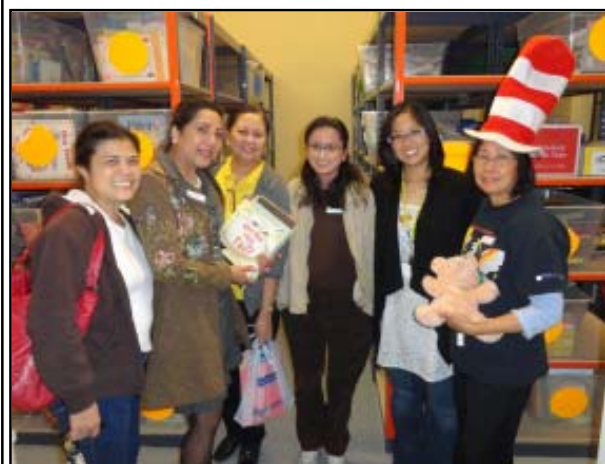
Reading Action Program (RAP) – “Read to Me Program” at UMOM New Day Center – Jan 22, 2013