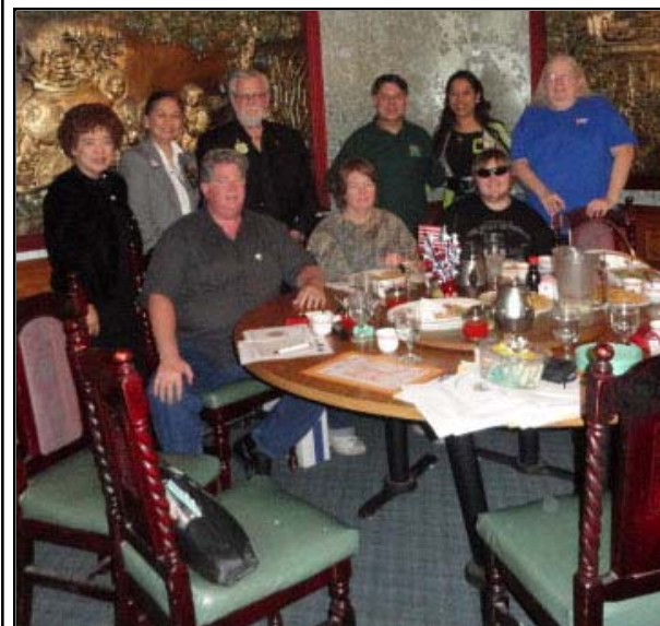
MD21C- Zone 8 - 3rd d Zone Meeting – Jan 13, 2013 at the Golden Phoenix Restaurant.