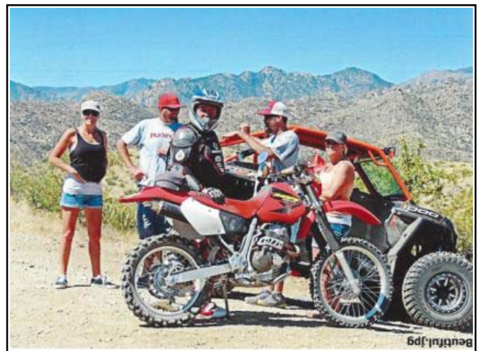
The Bradshaw Mountain Lions Club held their spring poker run on May 31, 2014. 33 entries were received for the rugged course which covered the hills near Cordes Lakes, Az. off Interstate 17. The next poker run will be on October 5 in conjunction with the Agua Fria Days Festival. More later on that. All Lions and the public are urged to attend. Registration will be available soon.