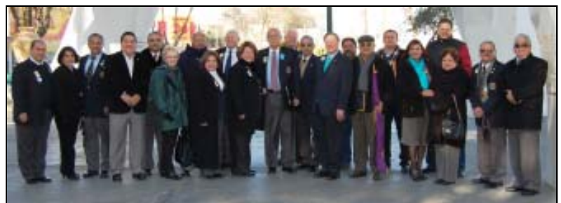
A group of Mexican and Arizona Lions at the Tijuana Lions Plaza in downtown Tijuana.