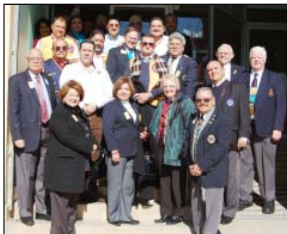
A group of Mexican and Arizona Lions on Tijuana A.C. Lions Club Clinic steps.