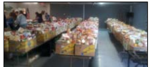
Food baskets ready to go.