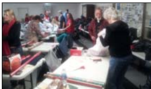
Lions wrapping gifts.